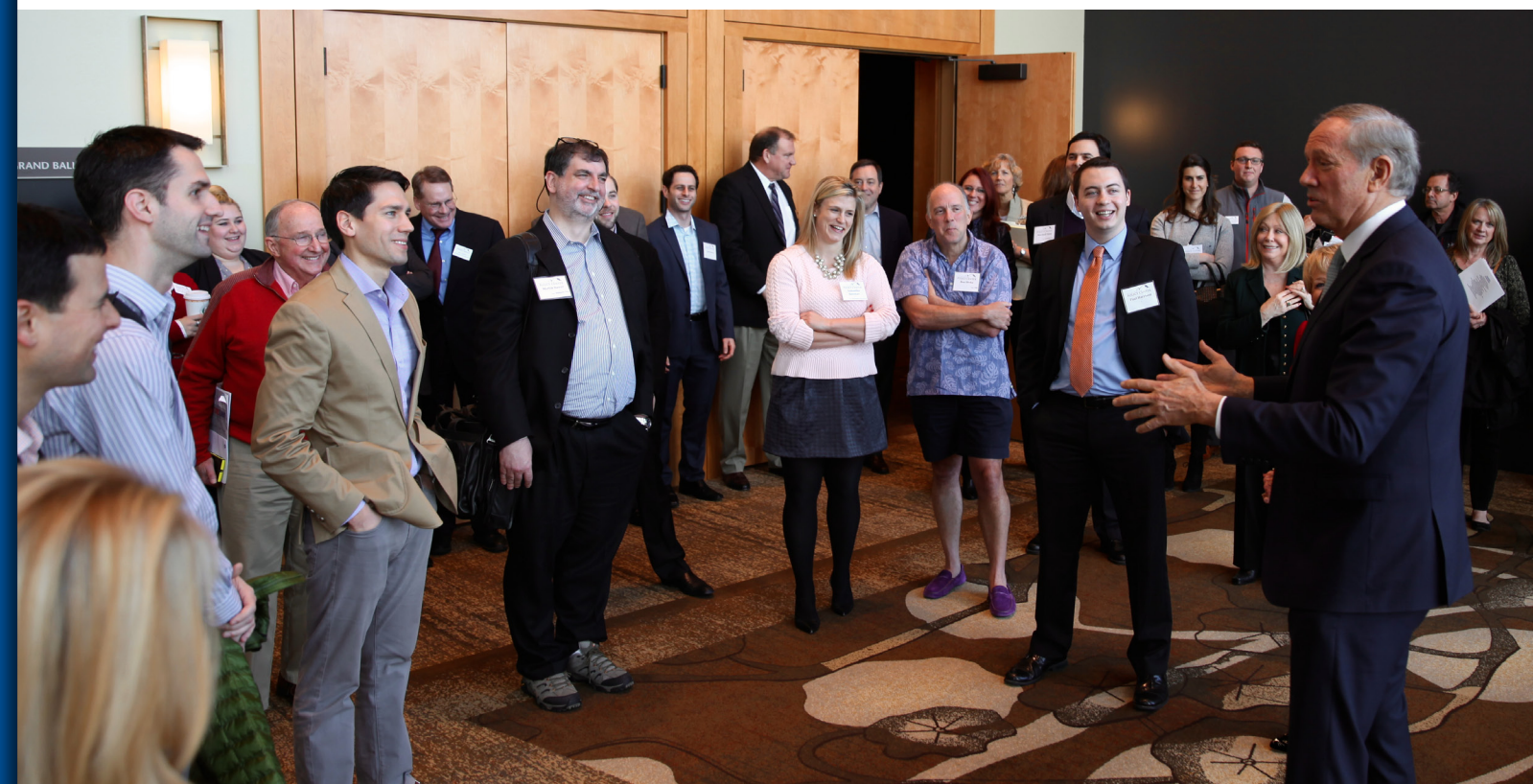
Former New York Governor George Pataki addresses WPC's Pillar Society and Young Professional members at a private reception following WPC's 2015 Solutions Summit.