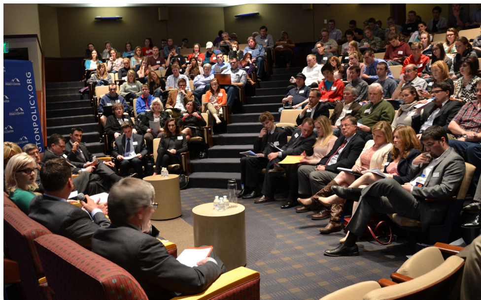
Over 100 students, community and political leaders attended WPC's WSU Minimum Wage Debate in February 2015 featuring a panel of economists, experts and activists. Debates at UW and Gonzaga will be held in April 2015.