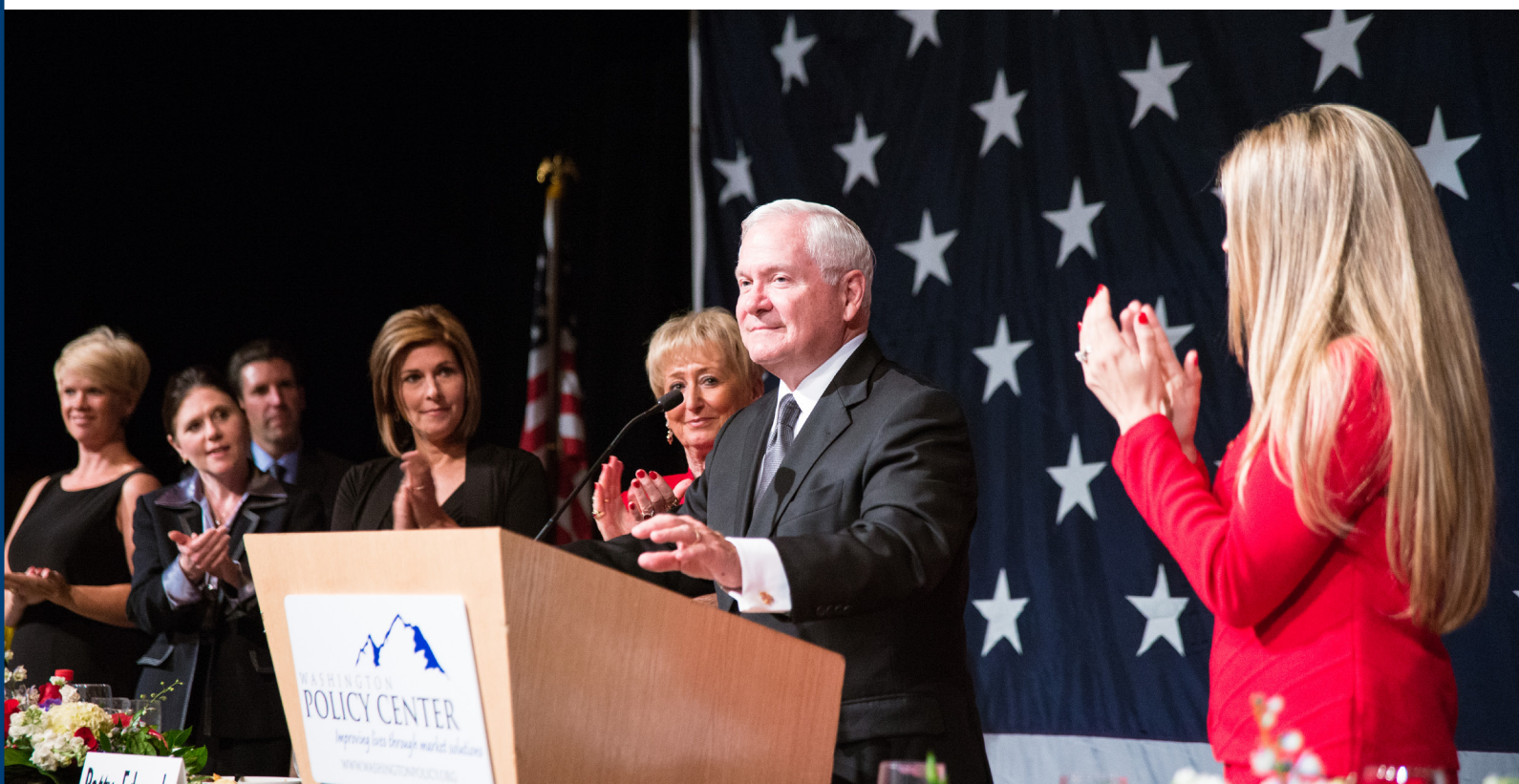
Dr. Robert Gates welcomed by a standing ovation at WPC's 2014 Annual Dinner event.

In 2014, we welcomed our largest crowd in Spokane and Bellevue, including a packed Young Professional Dinner event! To celebrate five years in Eastern Washington, we held a separate Dinner event in Spokane with two live speakers. As a benefit of joining WPC's Pillar Society, members are not only guaranteed a table or tickets for the Annual Dinners, but given priority Pillar Society seating each year of their pledge. For more information about this exciting event, visit www.washingtonpolicy.org/annualdinner .