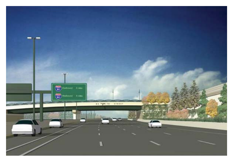
A widened, repaved I-405, in combination with new landscaping and retaining wall treatments, will reduce congestion and improve safety and aesthetics, between NE 85th and NE 124th Streets.

In addition to adding a lane in each direction, crews will widen the inside and outside shoulders. Once completed, the entire roadway within the project area will be grinded (to remove pavement inconsistencies), repaved, and restriped.