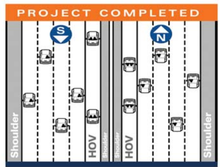
By the end of 2006, WSDOT will open four slightly narrowed general purpose lanes. Four general purpose lanes and wider shoulders will be opened by the end of 2007.